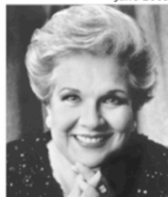
Marilyn Horne June 2009