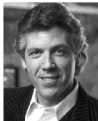
Thomas Hampson October 2008

We very much look forward to Marilyn Horne teaching a three-day program starting on June 11th, 2009.